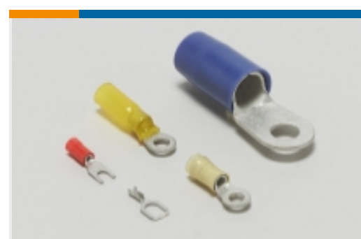
Ring Terminals &amp; Spade Terminals(537)